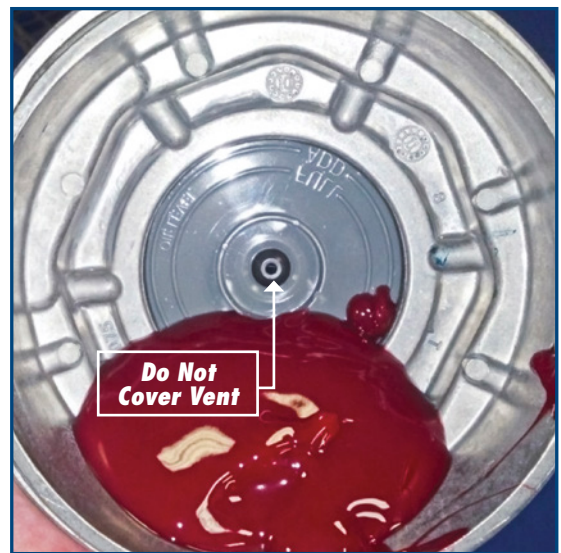
Figure 2: Fill Level for Semi-fluid Grease

Failure to follow the above procedure will result in "filming" or cosmetic seepage of lubricant through the center vent onto the external face of the hub cap during initial operation.