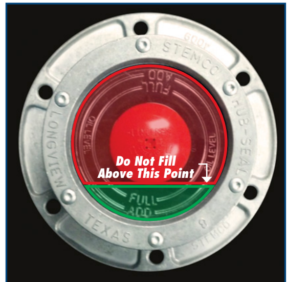
Figure 1: Fill Level for Oil

Failure to follow the above procedure will result in "filming" or cosmetic seepage of lubricant through the center vent onto the external face of the hub cap during initial operation.