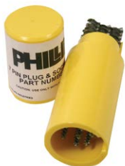
7-Way Plug & Socket Brush 4-121