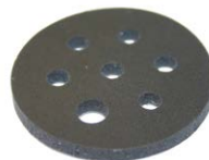
Foam Socket Seal 15-795

For new and innovative products, visit www.phillipsind.com