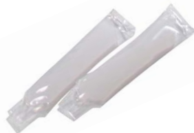
QWIK-SHOT™ Dielectric Grease 4-250